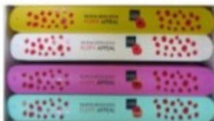
Snap Bands - £1.50