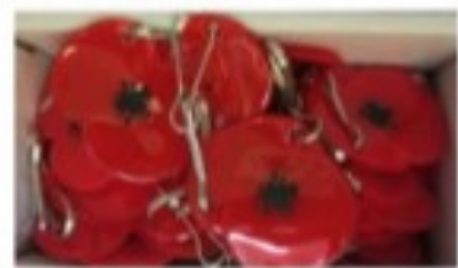
Reflectors - 50p