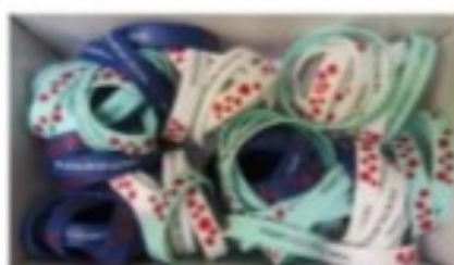
Wristbands - £1